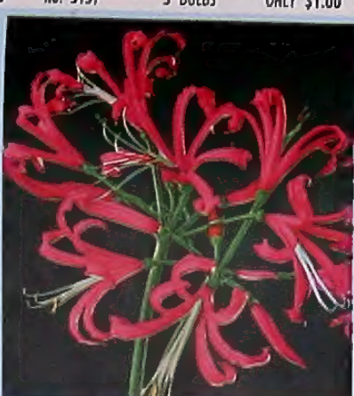
SPIDER LILY (Lycoris)

A wonderful colorful house plant that will bloom this year if planted soon. You can grow these bulbs in a five inch pot. The Spider Lily will grow well outdoors in areas of mild climate. Beautiful shades of rose-pink, yellow and red. Mixed colors.